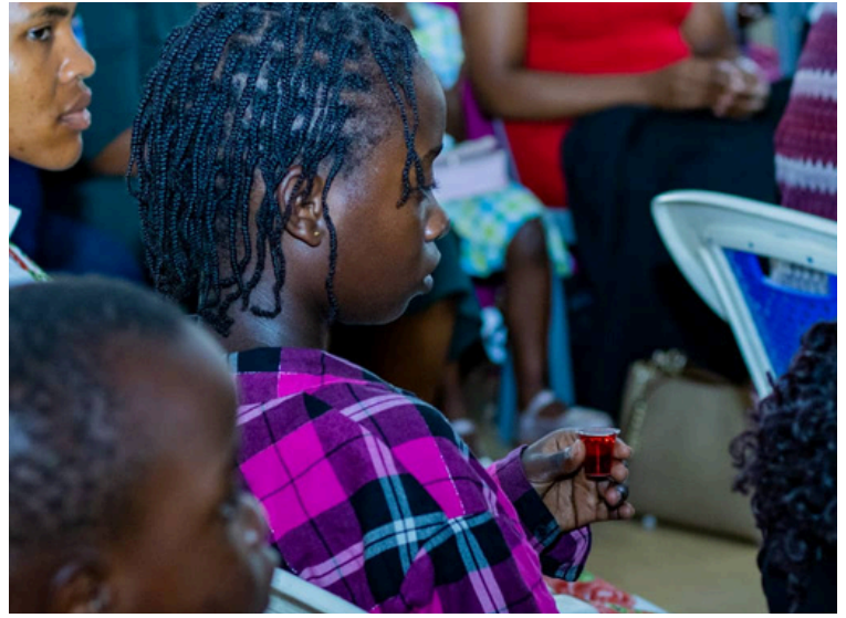
Children partaking of Holy Communion