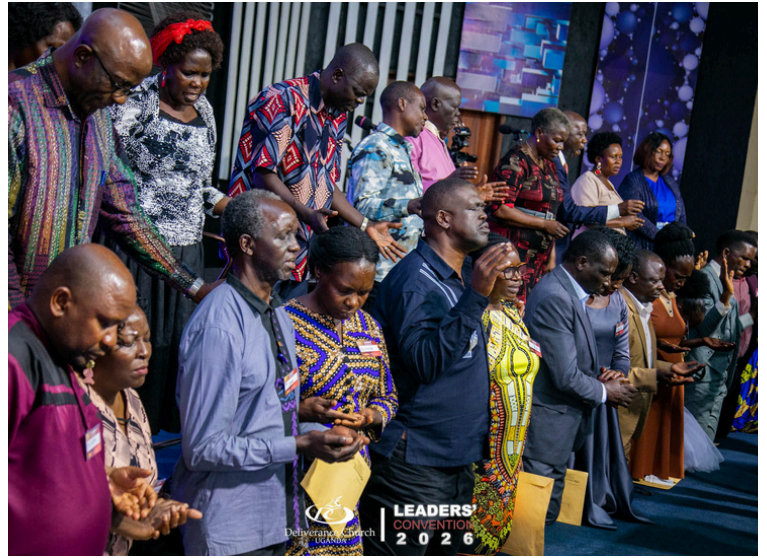
The New Team Leaders of DCU being commissioned during the Leaders Convention