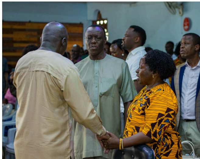
A moment of Intercession during the Service