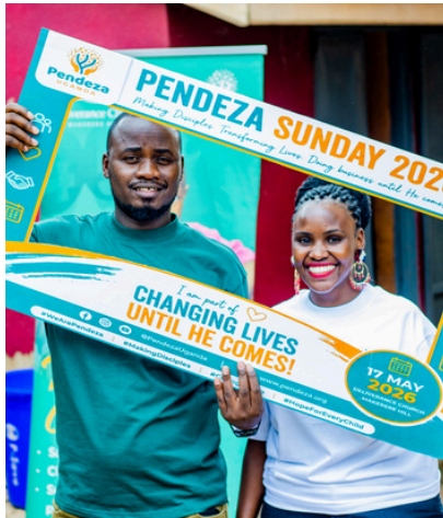
Pendeza Sunday was unforgettable, from the Praise to the Fellowship