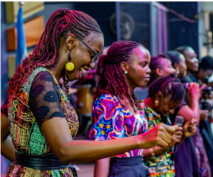
The High Praise Choir leading Praise and Worship...the African way.