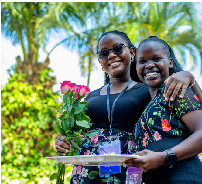
Women's Day Celebration on 8th March. Each lady walked away with a rose, a card and a piece of cake.